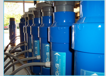
SBC fully assembled

With offices in Florida and California, its products are fabricated domestically. Together with its sister companies Cla-Val and Griswold Controls, Griswold Water Systems capitalizes on over seven decades of combined experience in fluid dynamics, manufacturing, engineering systems, and product development. By providing repeatable, measurable results, Griswold Water Systems' applied technology is good for the environment and the bottom line. Griswold Water Systems – because the world depends on water.