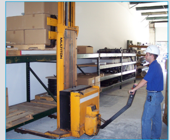
components arrive in the warehouse